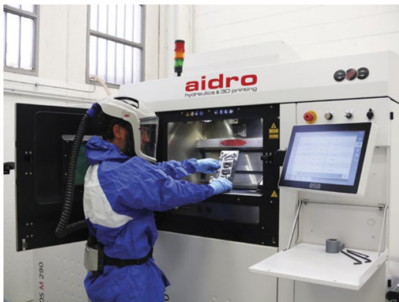
Fig. 4 An EOS M 290 PBF-LB machine at Aidro