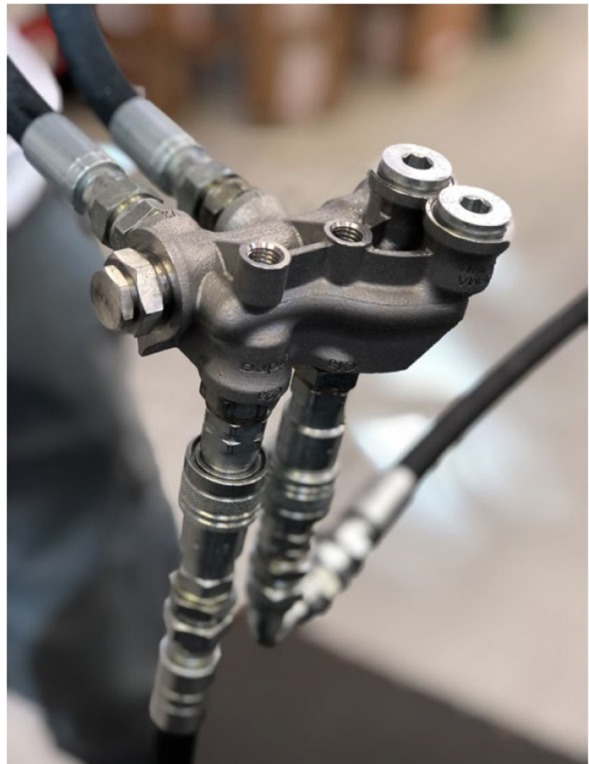
Fig. 3 Testing of the hydraulic block shown in Fig. 2 which, thanks to the optimisation of the design, enabled a weight reduction from 3.8 kg of the conventional part to 0.63 kg for the AM part

The main benefits of additively manufactured hydraulic components in the context of their most common applications are as follows: