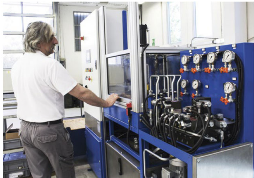
Fig. 9 A test bench for hydraulics components at Aidro

After the first questions are answered, it is necessary to maintain ongoing communication throughout the Additive Manufacturing process chain, from designing to post-processing, in order to make sure that the part is manufactured according to the needs of the application. Companies that approach Aidro either need to redesign a part made with conventional processes that does not fulfil specific requirements, or they know which benefits of AM they want to take advantage of, but do not know how to achieve their goals.