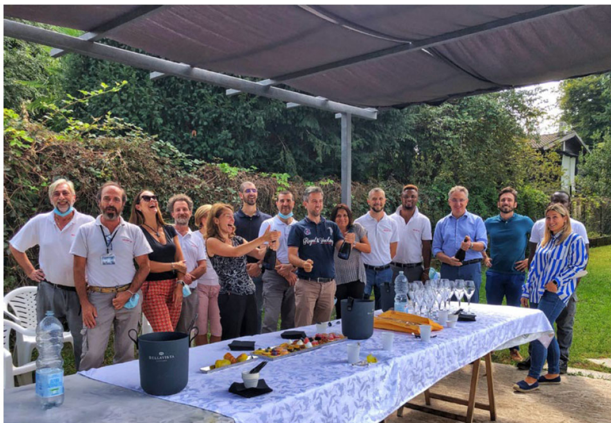
Fig. 11 Celebrations at Aidro for the announcement of its acquisition by Desktop Metal

has to be integrated with traditional methodologies," Tirelli clarified, "which means that it is not supposed to replace established production processes, but to stand in beside them, and satisfy those requirements that otherwise could not be met."