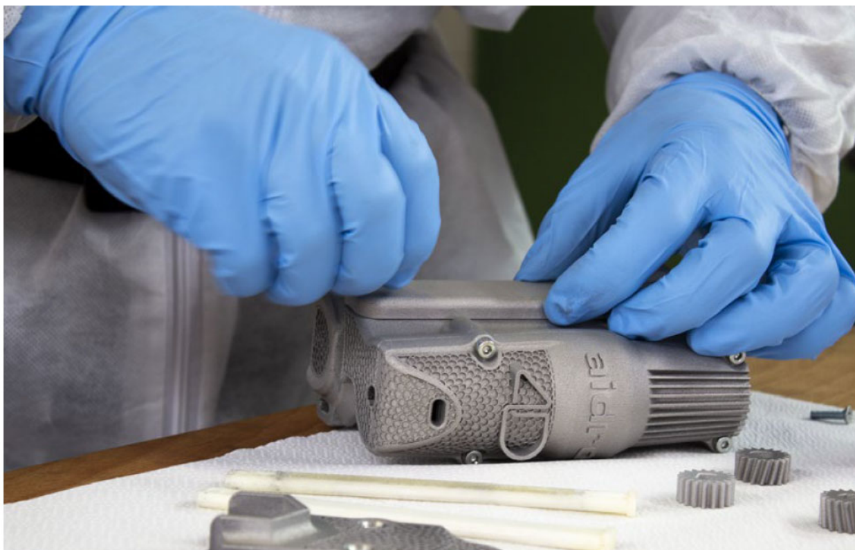
Fig. 8 An accessible aeronautic system that allows pilots who have only one hand to fly safely and easily. The AM flight control parts shown, manufactured by Aidro, are used in the Servofly system ( www.servofly.it/en/ )

“Many large corporations are putting into action long-term programmes of digitalisation, and we are cooperating with them to investigate which of their spare parts can effectively be digitalised. In fact, this is the biggest obstacle: the identification and selection of which spare parts can be produced by AM...”