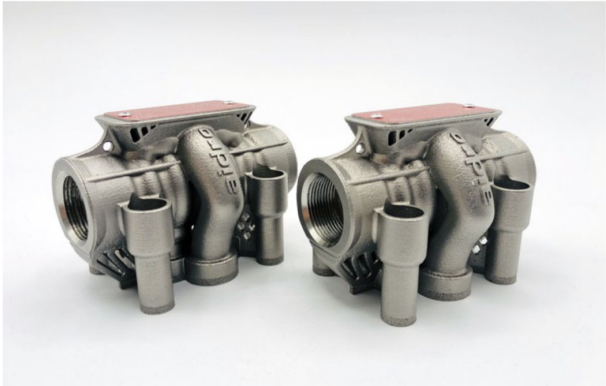
Fig. 7 Small AMES valves for hydraulic systems. AMES are CETOP directional control valves, here additively manufactured in 316L stainless steel and designed to work at 350 bar. These AM valves underwent high-pressure testing up to 1,400 bar

attention to their carbon footprint," said Tirelli. "Whereas we once focused on the CO 2 emissions of power plants, today many customers are interested in the CO 2 emitted to produce an object. In this context, Additive Manufacturing, being in itself a sustainable technology, has an advantage over traditional manufacturing processes. But, of course," she clarified, "it is also up to the individual companies. We, as Aidro, realise the importance of reducing our carbon footprint, and keep taking steps in this direction."