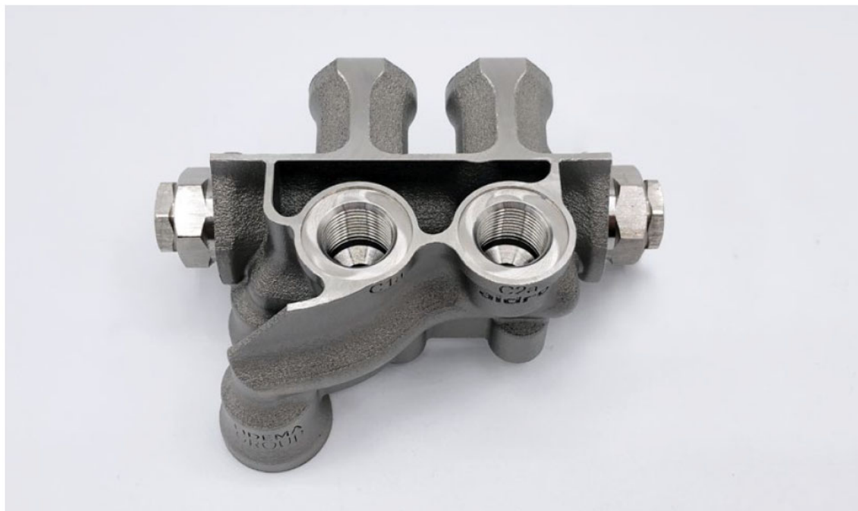
Fig. 2 A hydraulic block for a marine application, designed by Aidro and additively manufactured in 316L stainless steel for Fidema Group. The use of AM allowed a reduction in the number of hydraulic fittings that regularly leaked hydraulic fluid, a reduction in the overall dimensions, and the creation of a design optimised for the narrow space available. The arrangement of the cylinder control ports is customised according to the body orientation, not 'in-line', but with 90° exits