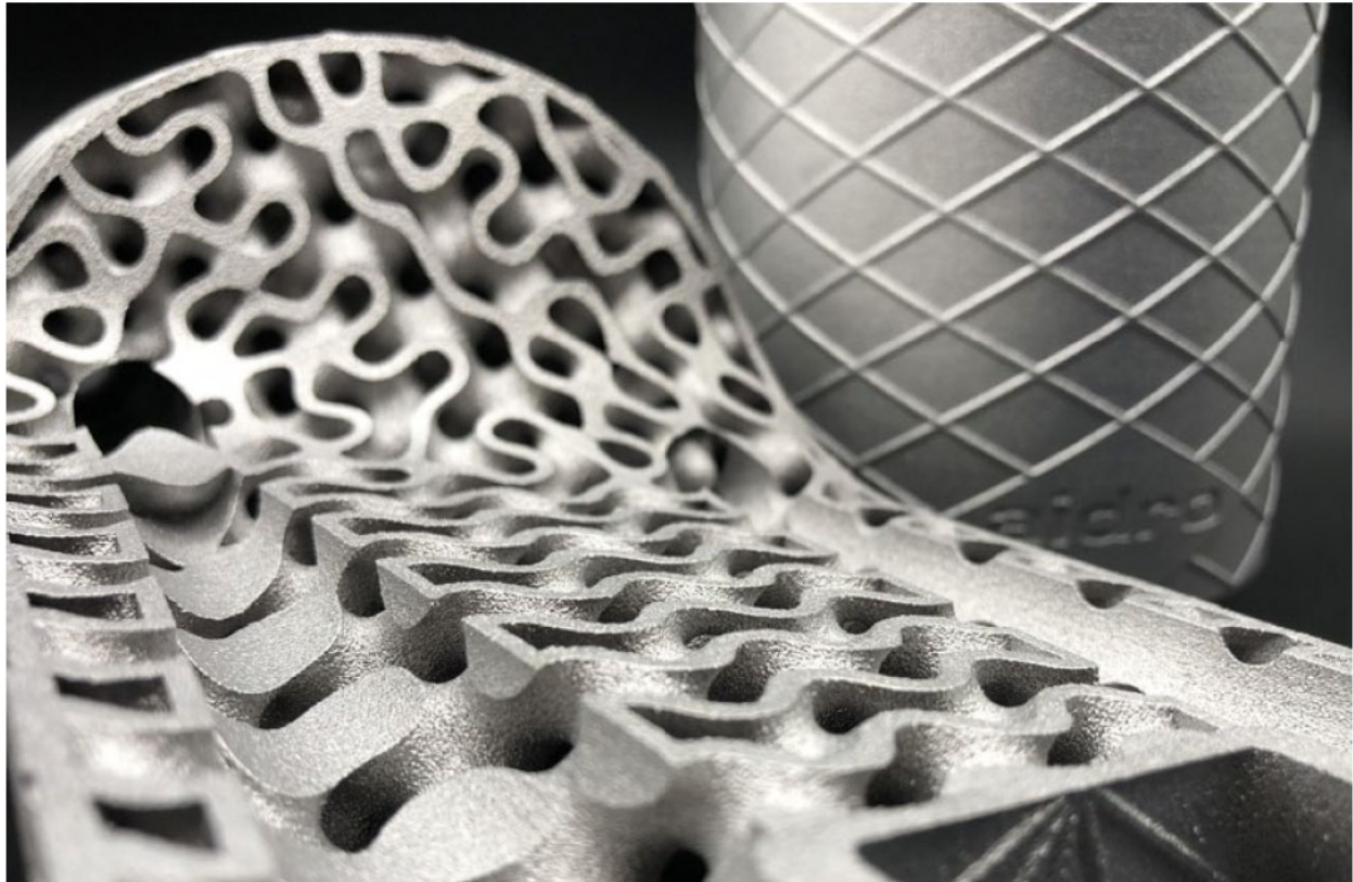
Fig. 6 Detail of an oil-water heat exchanger designed with complex internal gyroid features and additively manufactured in AlSi10Mg aluminium alloy

strength, durability, and corrosion resistance. This is especially important for applications that are either subjected to exceptional strain, for example tractors and other agricultural machinery that have to bear the continuous stress of uneven ground, bumps and holes, or applications that are in contact with a marine – and, therefore, highly corrosive – environment.