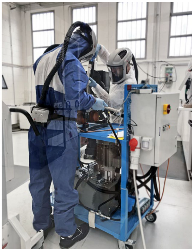
Fig. 5 Manual post-build operations include separation of parts from the build plate and support removal

channels, facilitating the flow and completely eliminating pressure drops. At the same time, this eliminates the need for auxiliary caps and plugs in the manufacturing process, removing the risk of leakage and presenting the two-fold advantage of optimising performance while preventing any potential damage to the environment.